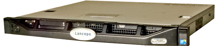
The StealthWatch FlowReplicator simplifies the collection and distribution of network and security data across the enterprise.

StealthWatch by Lancop e is the leading solution for flow-based security, network and application performance monitoring across physical and virtual environments. By leveraging NetFlow™, sFlow® and other flow data from existing routers and switches, StealthWatch provides the network visibility and actionable insight required to troubleshoot a wide range of network and security issues. Combining multiple capabilities into a single platform, StealthWatch cost-effectively streamlines workflows and dramatically reduces the time between problem onset and resolution.